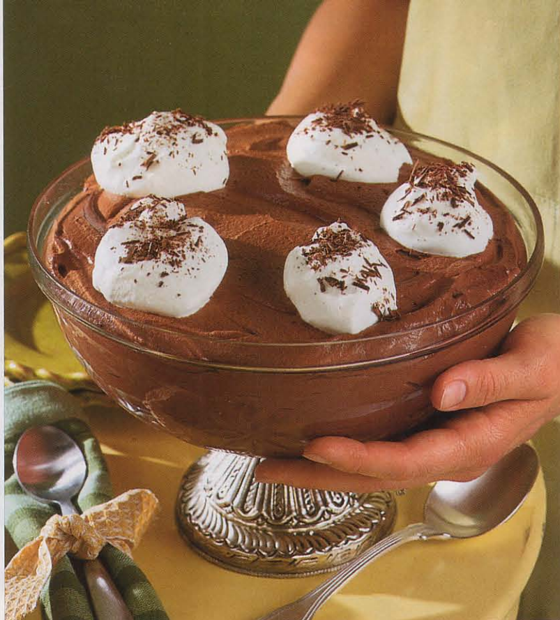
Serve Chocolate Mousse in a large bowl or in individual dessert dishes.

BAKE at 400° for 50 minutes or until potatoes are tender and mixture is