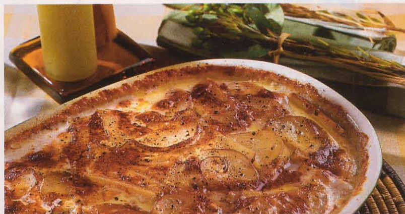
Gratin Potatoes is as easy as peel, slice, and bake.

BEAT remaining 2 cups cream at medium speed with an electric mixer until soft peaks form; fold cream into chocolate mixture. Pipe or spoon into a large serving bowl or dessert dishes. Garnish with additional whipped cream and grated chocolate, if desired. Chill 2 hours. ♦