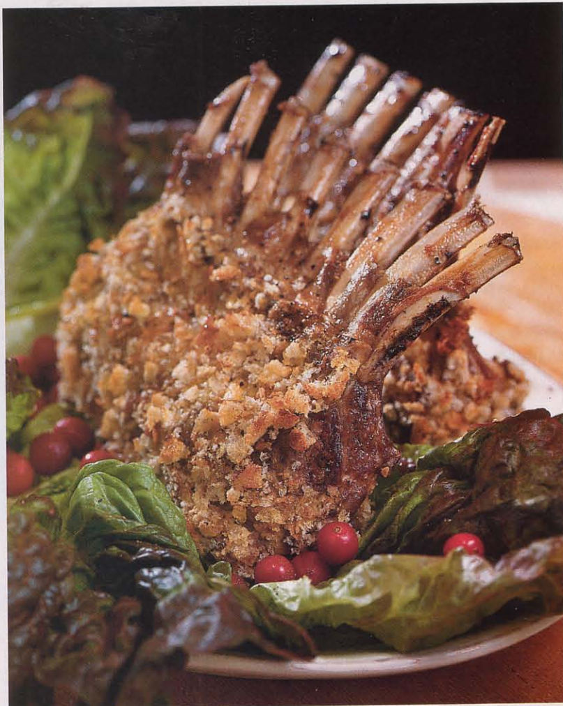
PHOTOGRAPHS: BETH DREILING, MEG MCKINNEY SIMILE / STYLING: CARI SOUTH

Succulent Dijon Rack of Lamb takes only six ingredients.